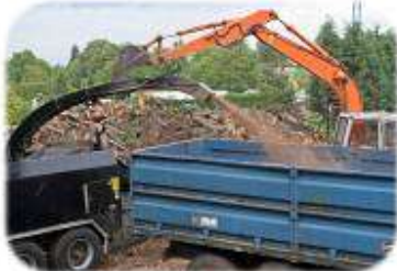
Local biomass energy