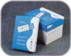
Local recycled products