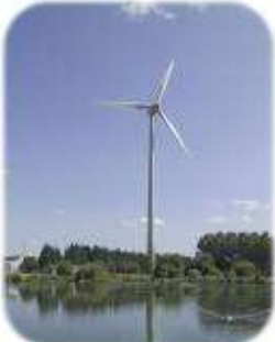
Local wind energy