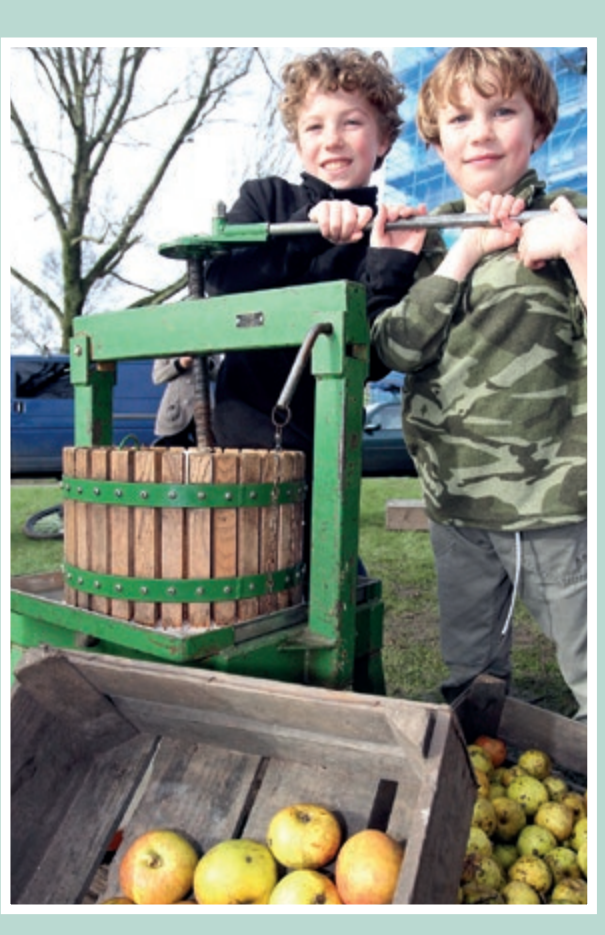
▲ Autumn is applepressing time!