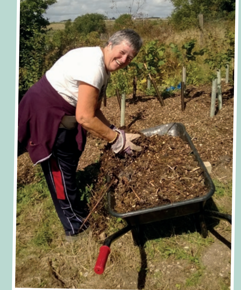
▲ Mulching helps keep in moisture and suppress weeds