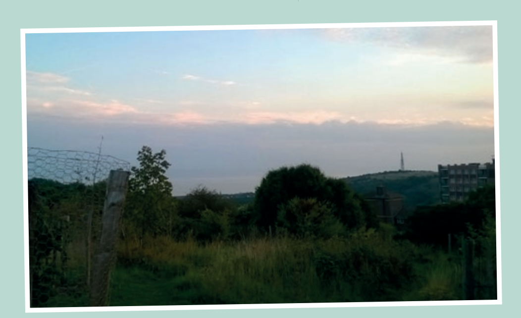
▲ Late summer sunset