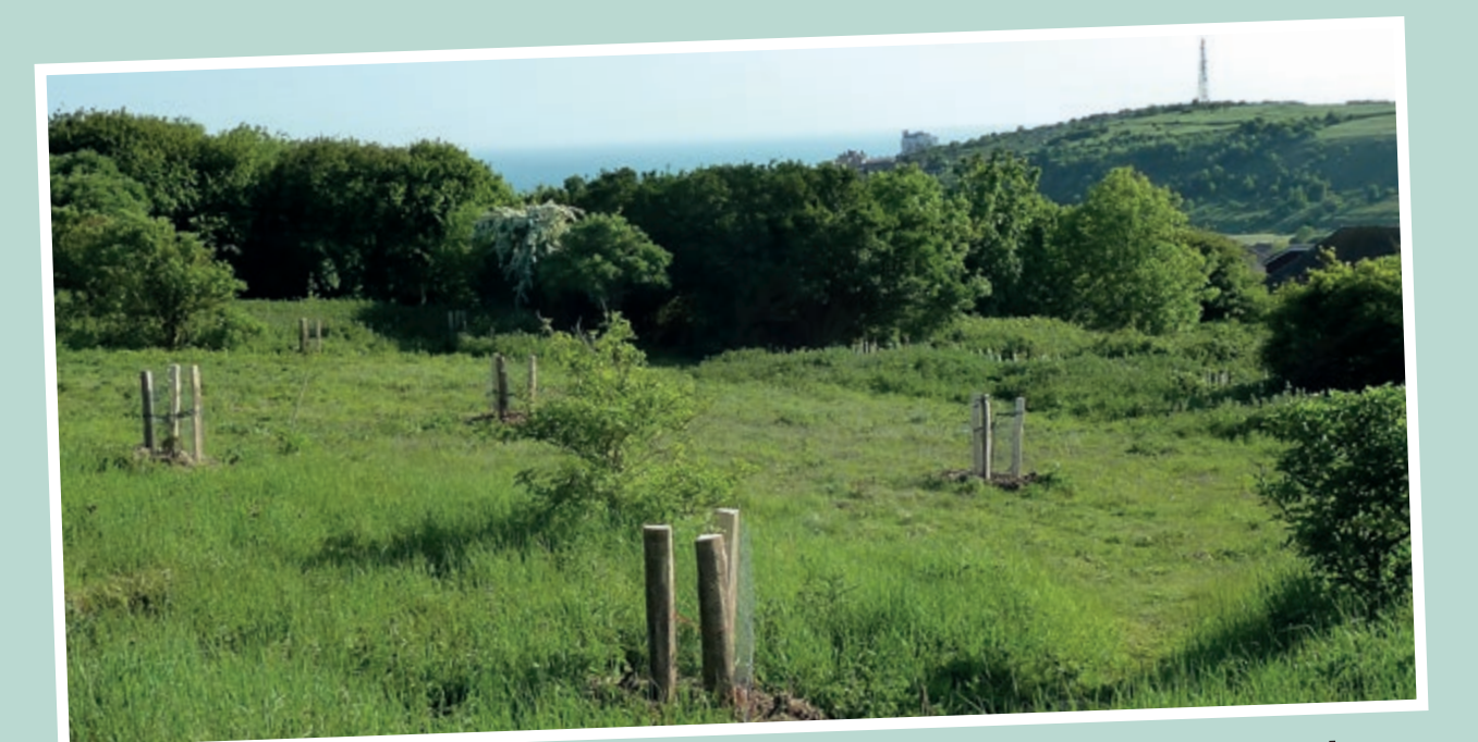
▲ Early summer: a stunning view towards the Channel and the iconic mast on Whitehawk Hill

Racehill Community Orchard is an open space that anyone can enjoy; for dog-walking, rambling, picnics or enjoying nature. There are over 200 fruit trees and thousands of native hedgerow plants on this site.