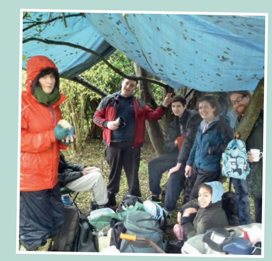
▲ Sometimes you just have to run for shelter and a hot cup of tea!