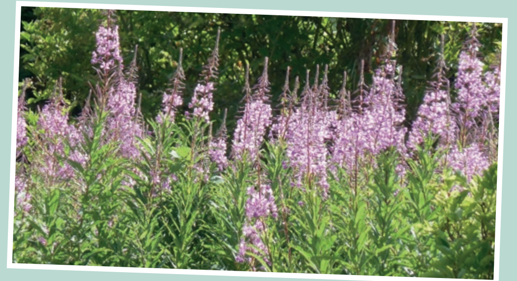
▲ Late Spring: Rose-bay Willowherb— wild food and medicine