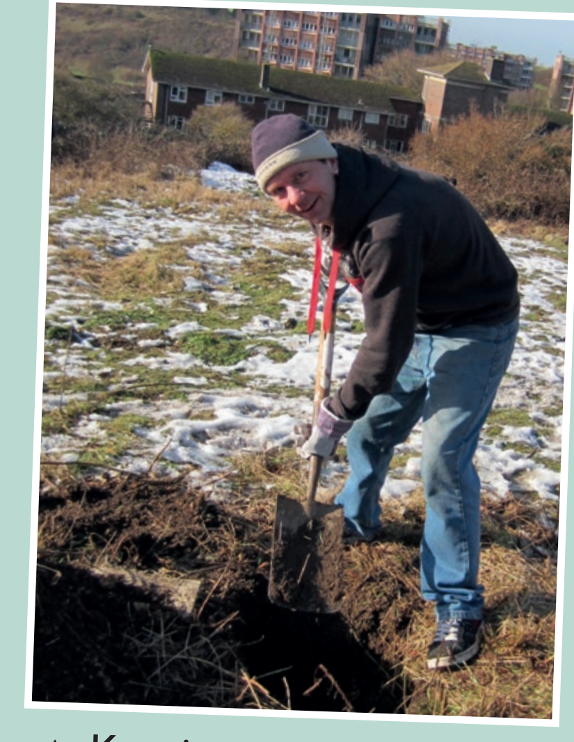
▲ Keeping warm in Winter!