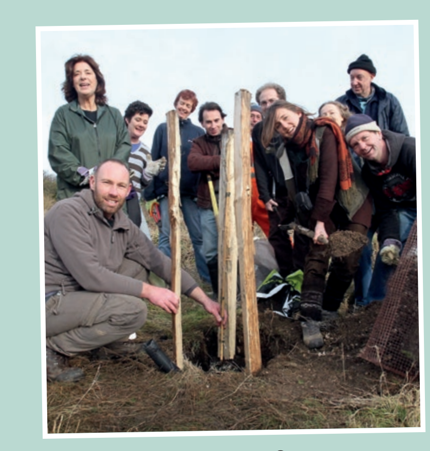
▲ Planting the first tree

For more information visit: www.racehillorchard.org.uk Or call: 07746 185927